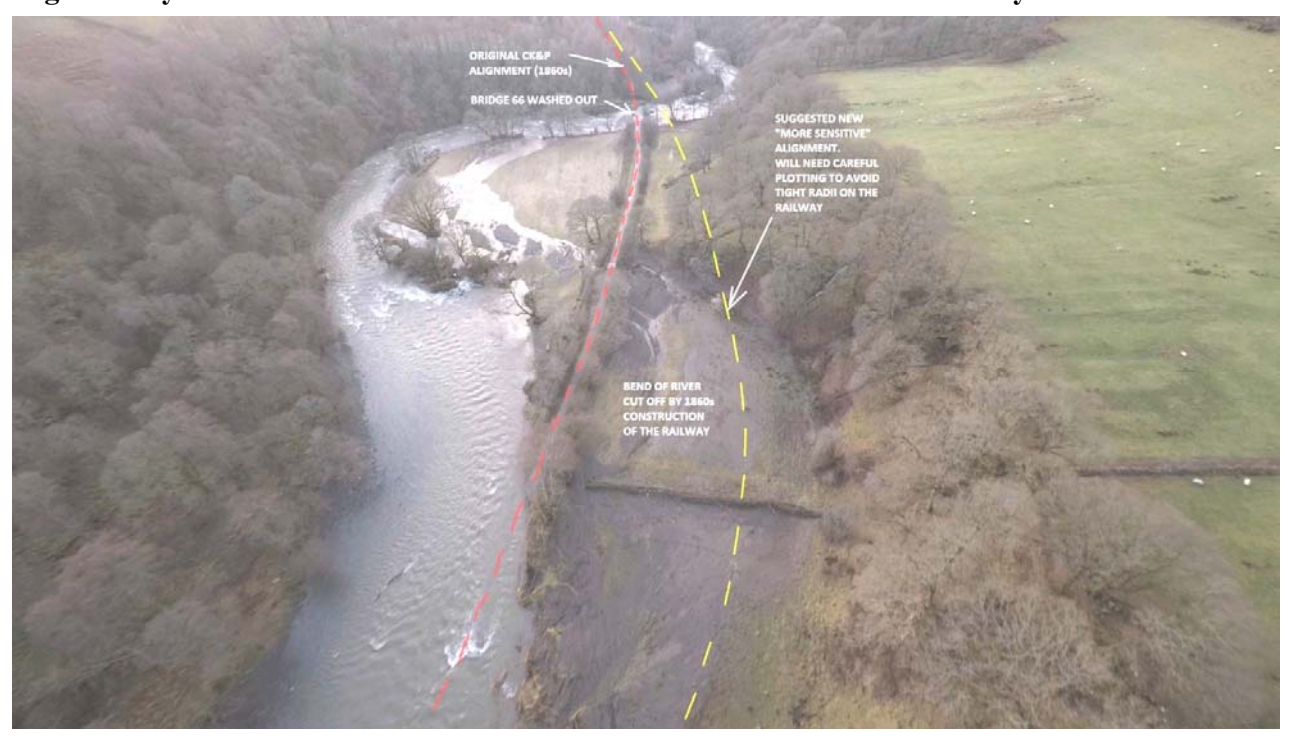
Aerial photograph (c) Terry Abraham. Annotated by Cedric Martindale

CKP Railways plc (CKP) has proposed that a new embankment should be built on an alignment nearer the north side of the gorge. That would allow more space for floodwater, reducing the strength of any future flood. It would also make the route more resilient to any future storms.