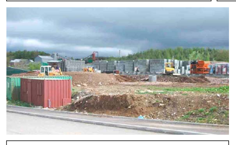
Trackbed east from oil depot to concrete works. Food warehouse site is to the left and does not obstruct the trackbed.