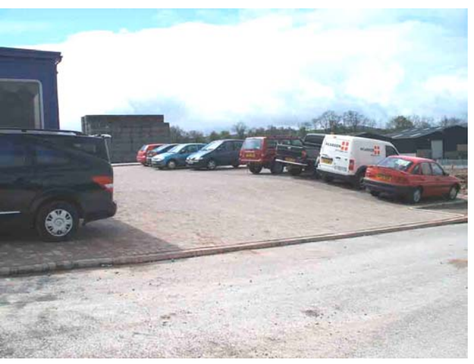
Trackbed west through block yard and car park. Ground levels have changed but there are no permanent buildings on the alignment.