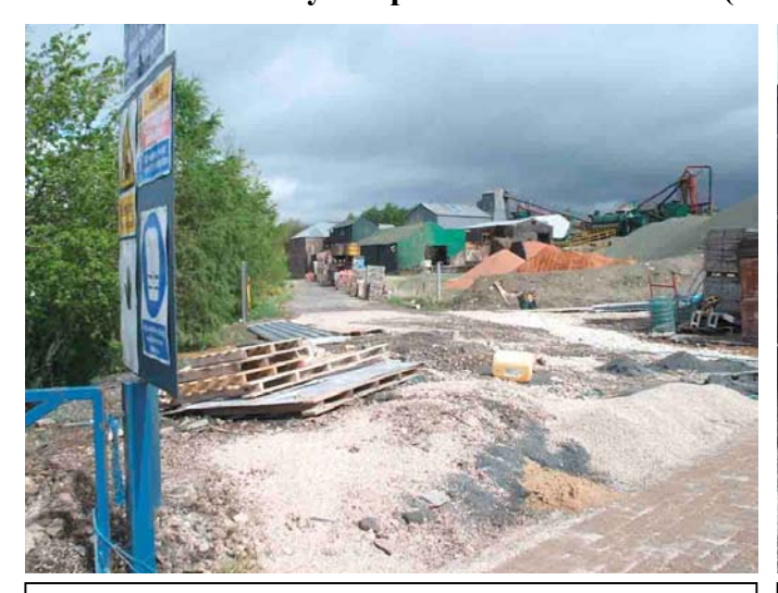
Trackbed east of the block yard, past the carbon works, towards Penrith. Untidy, perhaps, but not obstructed.

These photographs were taken on the 24th of April 2007. They are presented east to west (starting at the Penrith end of the site):